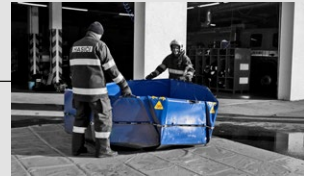
Manipulation with Octagon