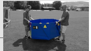
Manipulation with Hexagon